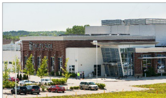
Tinley Park Convention Center