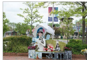
Benches on the Avenue