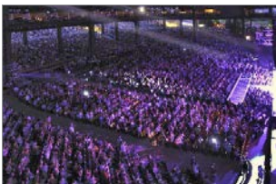
Hollywood Casino Amphitheatre

Our employees are committed to providing excellent public service to the residents of Tinley Park. The Village of Tinley Park's progress and growth depends on employees who take responsibility for the community and its success. Continuing the Village's tradition as a progressive community that takes pride in its accomplishments depends on your contribution as an employee. We are an active and progressive municipal government continually working to make Tinley Park a more enjoyable and attractive place to live. The effectiveness of our organization depends upon each employee. Our combined efforts result in a well-run, efficient Village government.