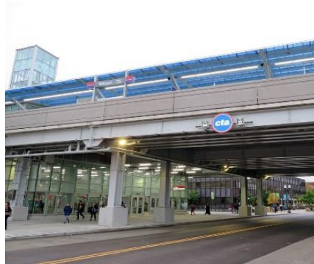
2018 Outstanding Civil Engineering Achievement Award Winner: CTA's Wilson Station Reconstruction