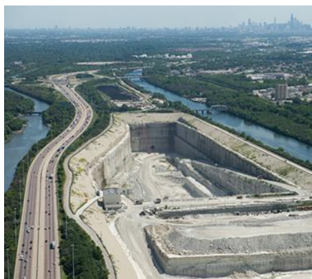
2018 Outstanding Civil Engineering Achievement Award Winner: MWRD's Chicagoland Underflow Plan – McCook Reservoir