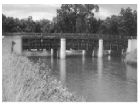
Photo compliments of the IBN Canal Commis Photo compliments of the IBN Canal Commis

ground transportation rendered the canals unnecessary. Two major problems impacted canal traffic: 1) from November to April, the canal was not navigable due to the weather, and 2) the fluctuation of the Illinois River during the summer months created traffic problems on the canal. The railroads proved to be more efficient and comfortable, particularly for passenger traffic. Various agencies have controlled the I&M Canal since the cessation of commercial operations in 1933. With the exception of the construction of Chicago's Stevenson