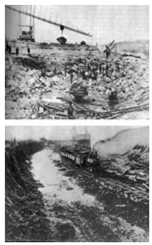
Two construction photos of the Illinois and Michigan Canal during the 19th Century. Original caption for left photo - "Excavation in Earth for Drainage Channel and Waterway One Third Depth".

Prior to construction of the canal, the Chicago Portage was one of the shorter land routes that permitted one to reach tributaries of the Mississippi River from Lake Michigan. Initially, Chief Engineer Gooding had intended to cross the 14-foot summit of the Chicago Portage by constructing the canal bottom at a lower level than Lake Michigan. This would permit the water in Lake Michigan to naturally flow to the southwest. This "deep cut" plan was soon abandoned upon encountering the top layer of stiff Niagaran dolomite, which underlies the Great Lakes basins as well as much of the Midwest. The design was modified then, to instead provide a lock and pumping station at the juncture of the south branch of the Chicago River and the canal Boats would be lifted over the summit level by supplying the lock with water