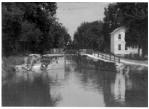
to by Roger Gass, Park Ranger 8

nurtured with the establishment of the canal. Limestone quarries, zinc smelters, flour mills, paper mills and steel manufacturers all benefited from the competitive shipping rates of the canal. In 1882, the highest gross tonnage (over 1 million ton) of goods was carried on the canal. The Illinois and Michigan Canal was one of the last of the great U.S. canals to be constructed. These inland waterways had a profound impact on the development of the nation and served a useful purpose until the growth of railroads and the development of more efficient