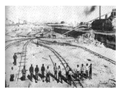
A construction picture of the Illinois and Michigan Canal during the 19th Century.

to the southwest, the additional construction cost to do this became prohibitive. Instead, the canal was typically only six feet deep, 60 feet wide at the normal water level, and 36 feet wide at the bottom. The canal was primarily constructed with black powder, horses, picks and shovels. Mostly European immigrants, particularly the Irish, completed this painstaking labor. In order to protect against malaria, cholera and dysentery, the workers requested that a gill (quarter pint) of whiskey per day be provided in addition to the dollar they received. The canal would be divided into three sections of construction. The summit level on the east would pass through what was known as the Chicago Portage.