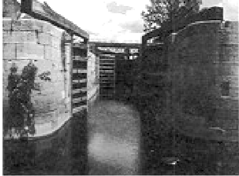
Recent photos of aqueducts along the I&M Canal.

aqueduct. Instead, a method called slack pool navigation was utilized. This required that a dam be constructed on the canal downstream of the river. Additionally, locks were built on both sides of the river. Canal boats would then be towed across the river in the slack pool created by the dam.